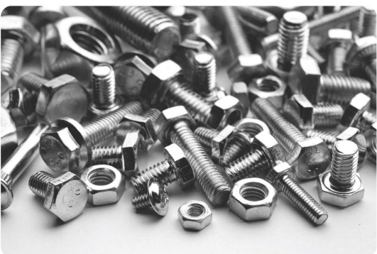
Nuts and Bolts