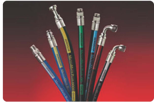
Hose and Fittings